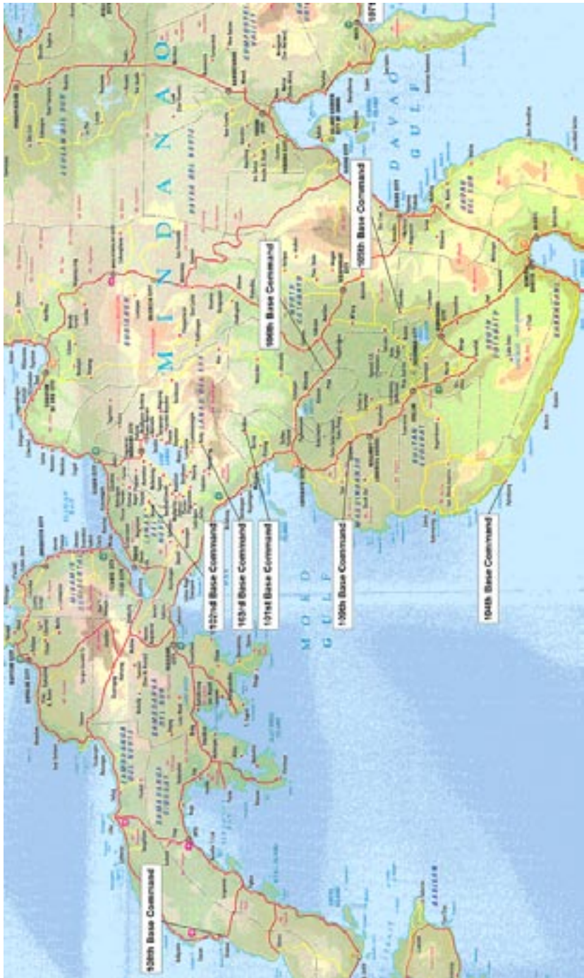
Figure 1. MILF Base Commands.